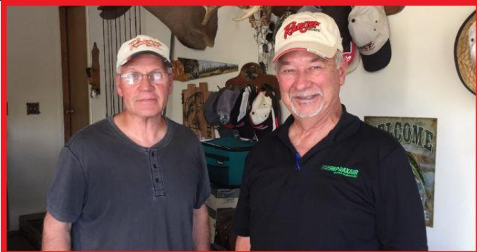
October 1, 2020 Winners

Caught 08/02/2020 * Fishing Guist Creek Lake Open Won $3,502.00