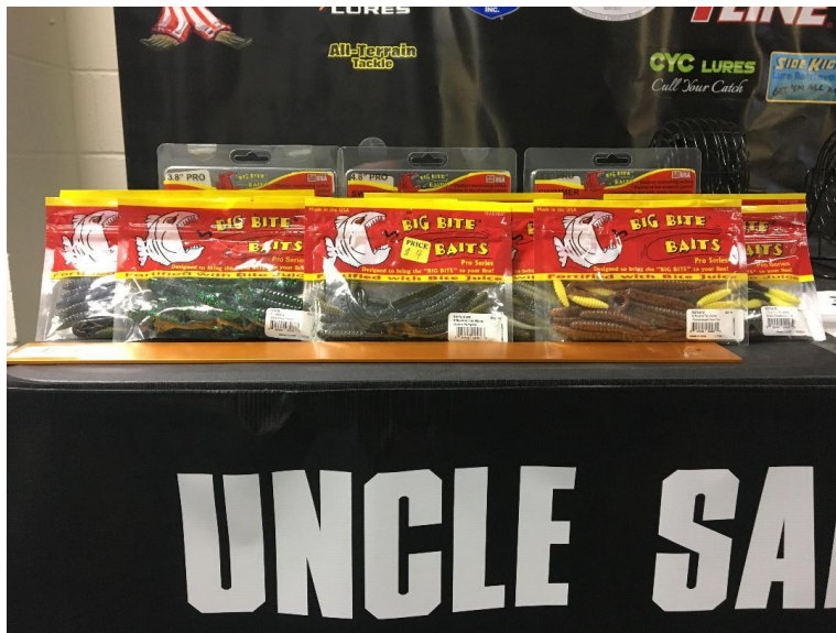
An Assortment of Big Bite Lures